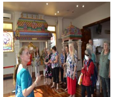
Harmony Day—20th March 2021