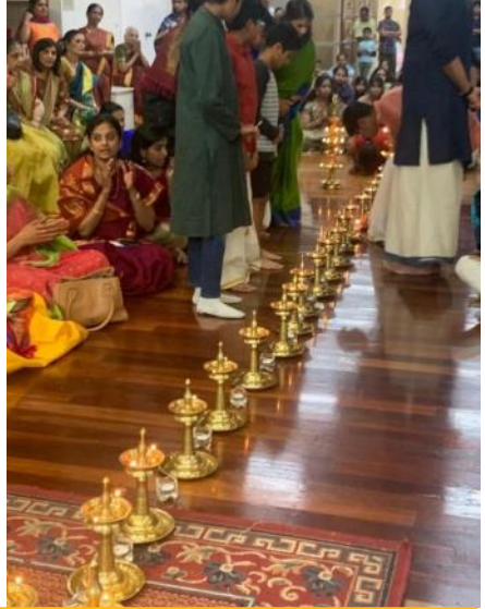
Makara Sankranti—14th Jan 2021