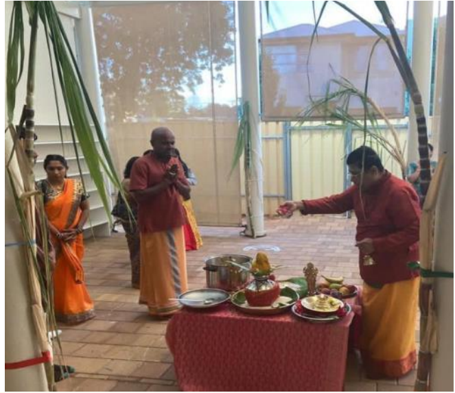
Pongal—14th Jan 2021