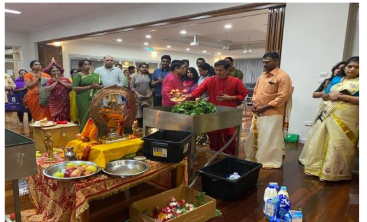
Maha Shivarathri—11th March 2021