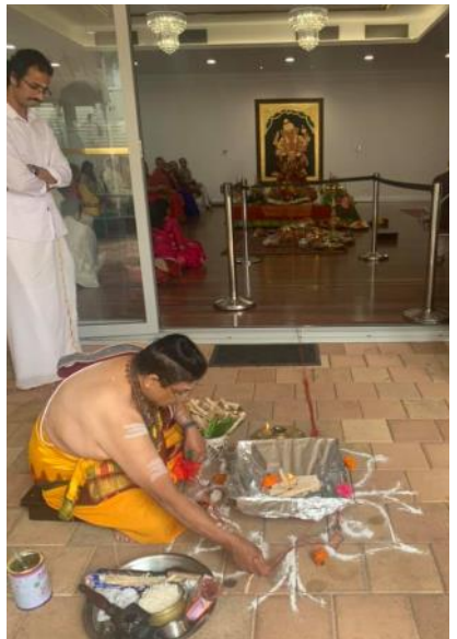
Temple Anniversary—26th Jan 2021