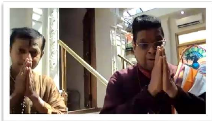
Streaming prayers and puja directly into people's homes during COVID-19 lockdown - even interstate and overseas.

Our two priests and the Committee members also successfully completed the prescribed COVID Marshal training . The training module covers the fundamentals of infection prevention and control for COVID-19.