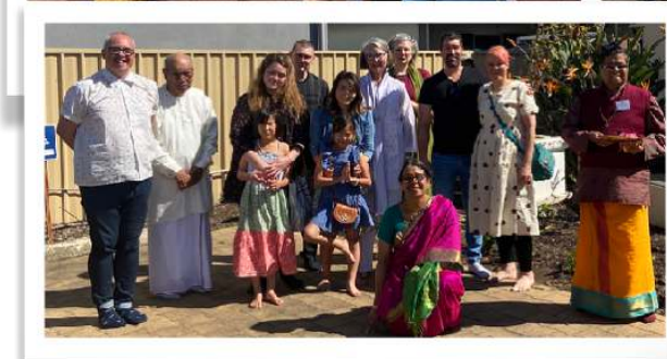
Recently the family and friends of one of our devotees came for prayers after her passing, and planted 2 rose bushes in the garden. She was a great supporter of the Temple and HSSA and left a donation in her will.